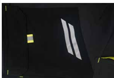
PRINTED REFLECTIVE LINES ON LEFT BACK POCKET