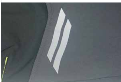
PRINTED REFLECTIVE LINES BELOW ANTI ABRASION ON KNEE