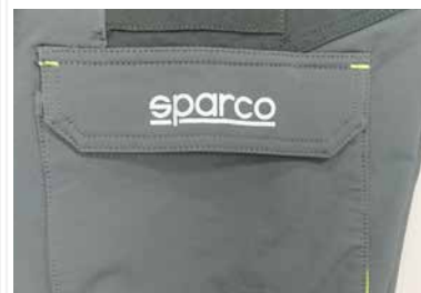
PRINTED REFLECTIVE SPARCO LOGO 70MM ON LEFT SIDE POCKET