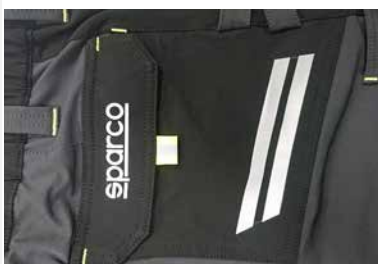
PRINTED REFLECTIVE LINES AND SPARCO LOGO 70MM ON RIGHT BACK POCKET